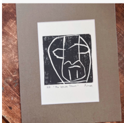
'The Upside Down'